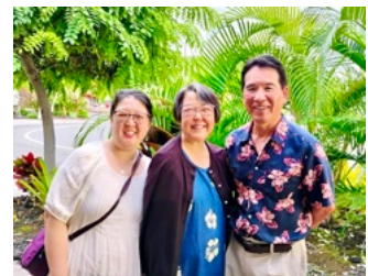
The Nakade ‘Ohana