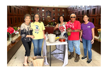
Clean Up Day Mahalo