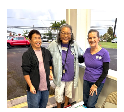
Pancake Breakfast Mahalo

The Daifukuji Fujinkai is very appreciative of the tremendous support received from sangha volunteers, donors, and friends who generously contributed to the success of the pancake breakfast fundraiser held on February 17, 2024. The fundraiser generated approximately $4,000 for the Fujinkai.