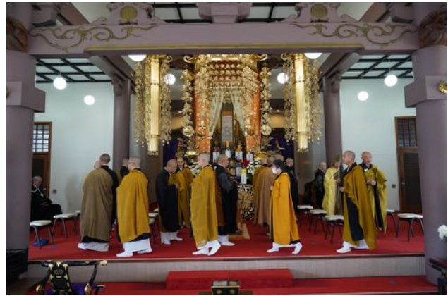
Ministers chant and walk in circumambulation