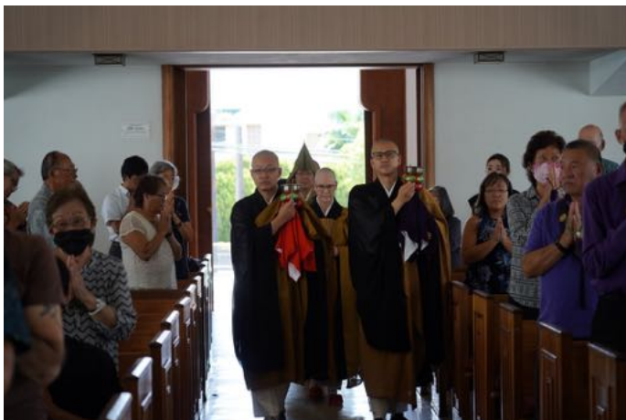
Priests entering the temple hall