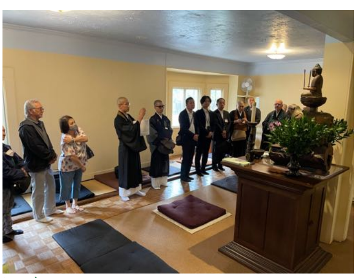
Visiting Zen Center of Los Angeles