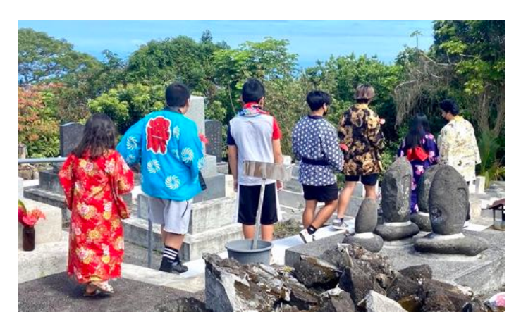
Children placing flowers on all of the graves.