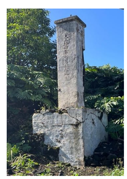
July 1925 - Shikoku 88 Temples Pilgrimage Sign

Please consider supporting through a monetary donation and or volunteering to help us preserve our history here in our community. Pūlama īa Kona Heritage Preservation Council is a 501(c)3 organization recognized by the IRS #99-0323867. Your charitable giving may qualify for a tax deduction.