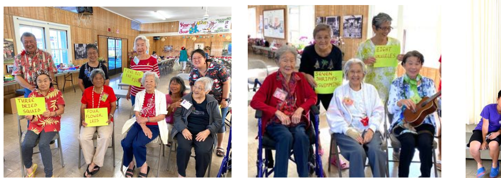
Project Dana Kupuna