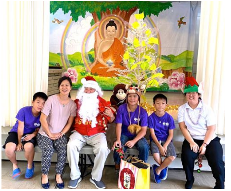
Family Sangha & Santa