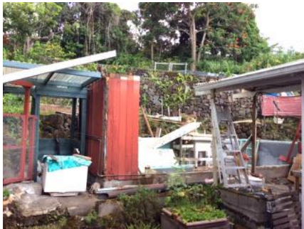
Old Structure Being Torn Down