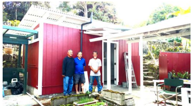
Newly Completed Laundry Room