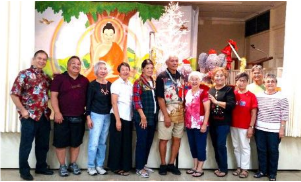
Daifukuji Happy Strummers