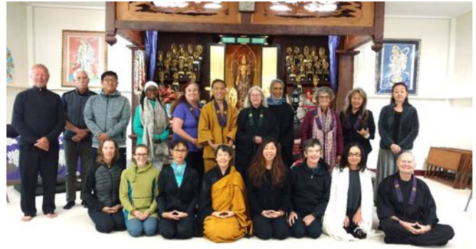
Daifukuji Zazenkai & Friends