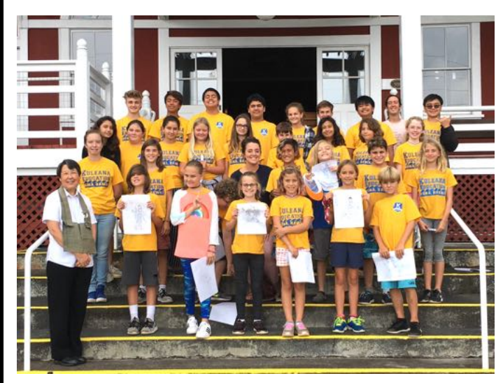
Kuleana Education school field trip