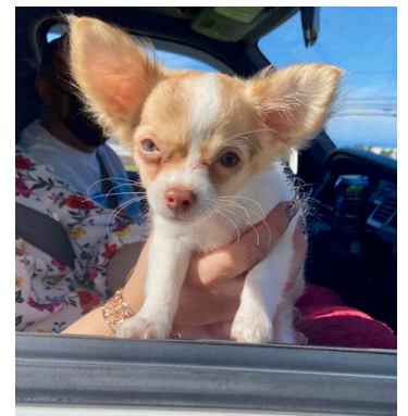
A Sweet Puppy