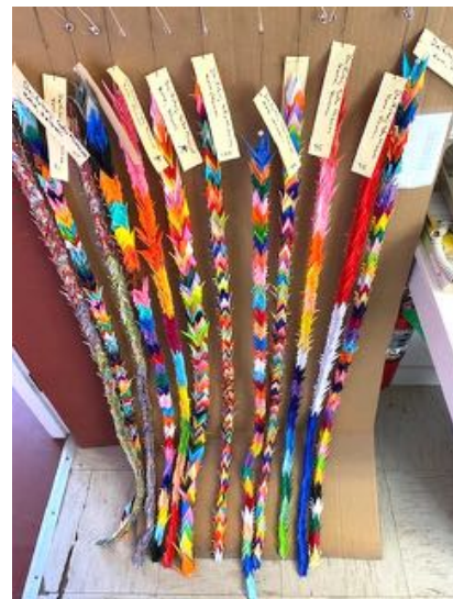
Arigato to Tyrone and Lena Ohta for folding & stringing 1,109 paper cranes!

A big mahalo to all who have participated in this project thus far!