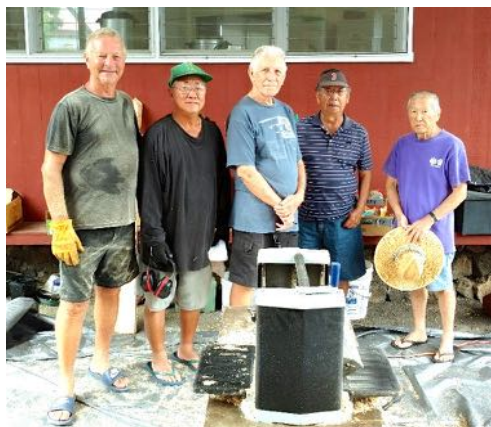
Toba Shaving Crew