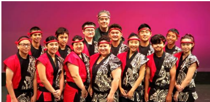
Kona Daifukuji Taiko at the 2019 Big Island Taiko Festival