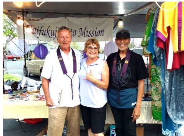
Gift Shop Volunteers at the Keauhou Bon Festival