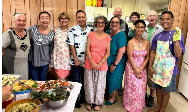
Mahalo to the Zazenkai for a great Hanamatsuri lunch.