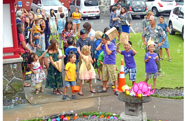
Hanamatsuri Spring Egg Hunt