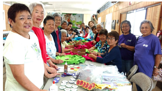
Fujinkai members preparing for the conference