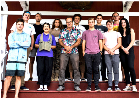
HPA students on a field trip to Daifukuji