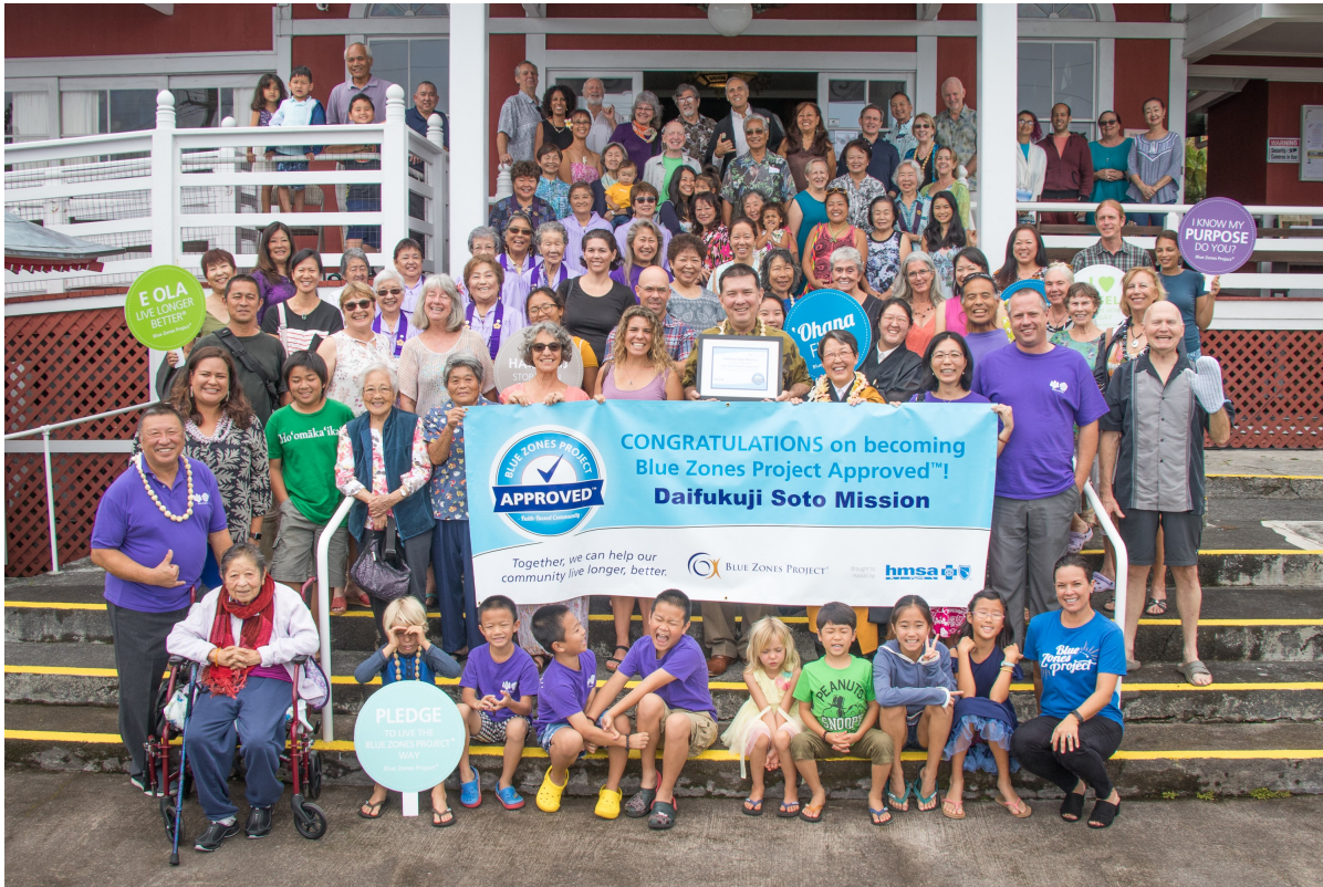
Here's our sangha on Buddha Day, celebrating our temple's recognition as the first approved Blue Zones Project faith-based organization in West Hawai'i.