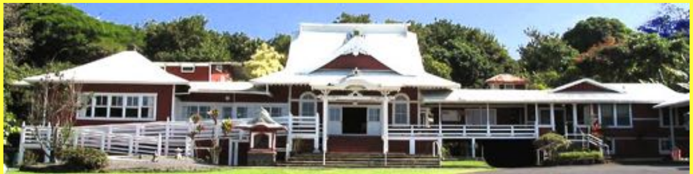
79-7241 Mamalahoa Hwy., Kealakekua, HI 96750