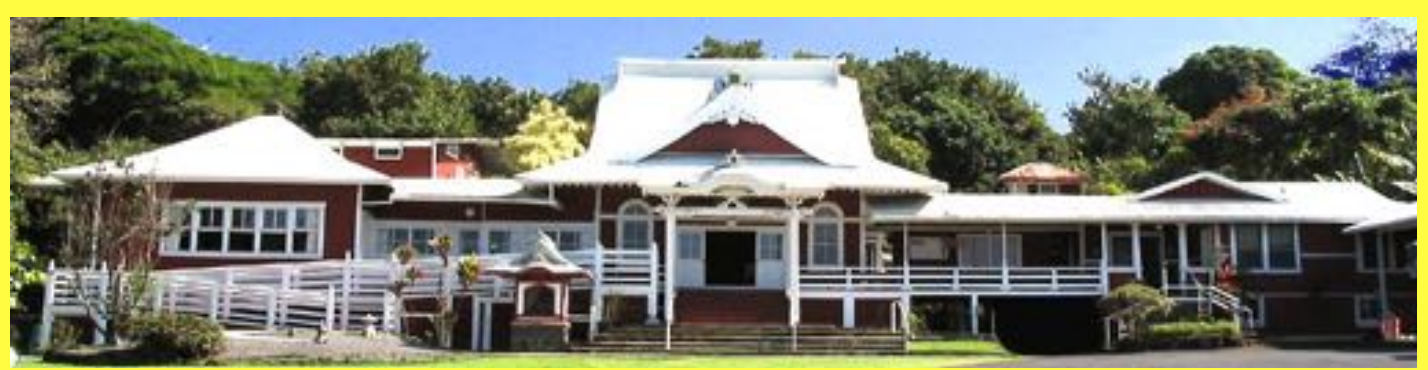
79-7241 Mamalahoa Hwy., Kealakekua, HI 96750