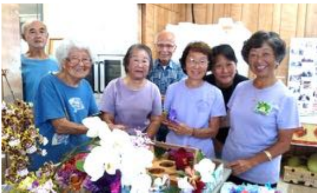
Kona Daifukuji Orchid Club