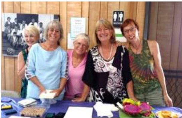
The Sangha Sisters