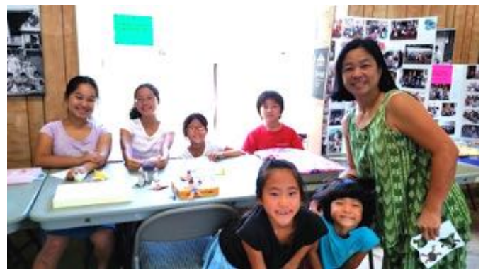
The Daifukuji Family Sangha