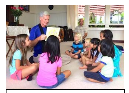
Gentei Sensei's Dharma lesson

Both morning and evening sessions include 20 minutes of chanting. Donations may be placed in the box on the incense table.