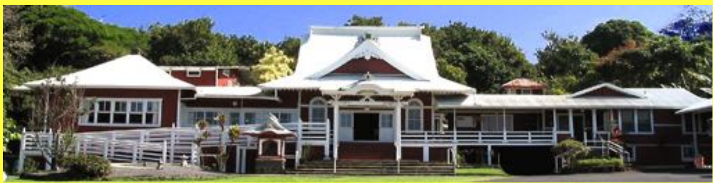
79-7241 Mamalahoa Hwy., Kealakekua, HI 96750