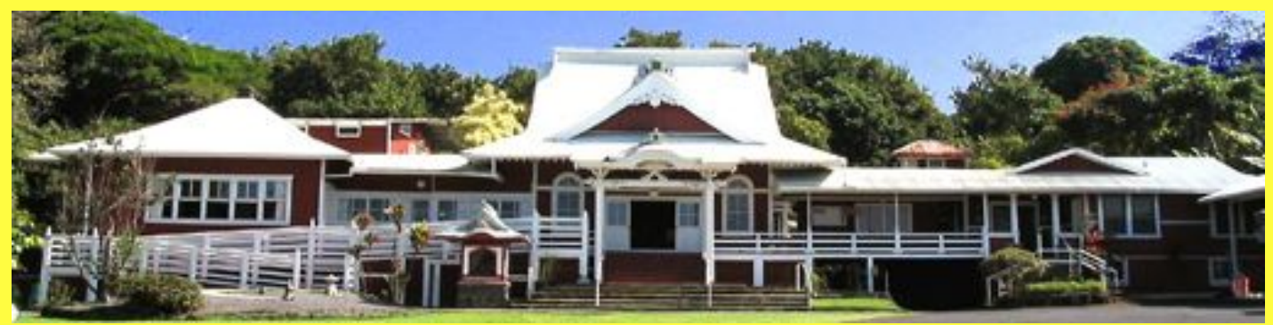
79-7241 Mamalahoa Hwy., Kealakekua, HI 96750

Okagesama de, thanks to countless beings, we are here today