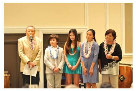
The Kodama Family