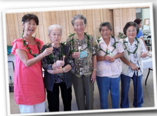
Project Dana September Birthdays