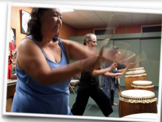
Zen Taiko Workshop, Sept. 16