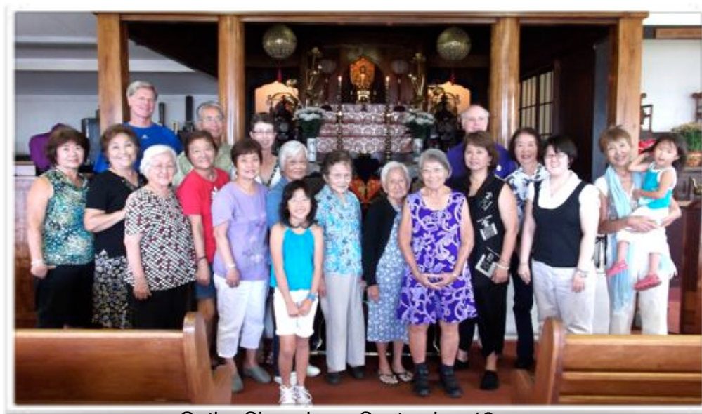
Gatha Sing-along, September 18