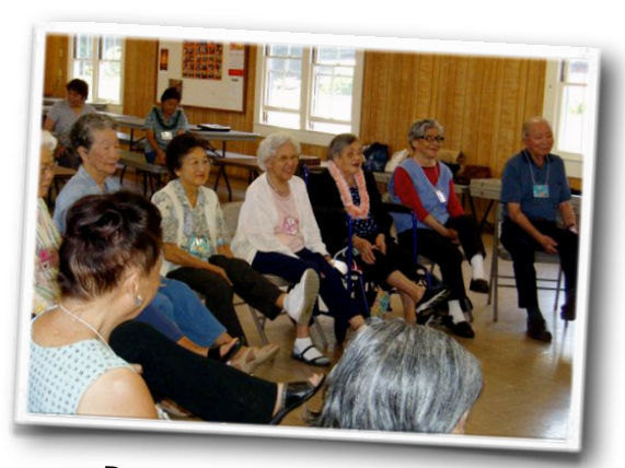
Project Dana Kupuna