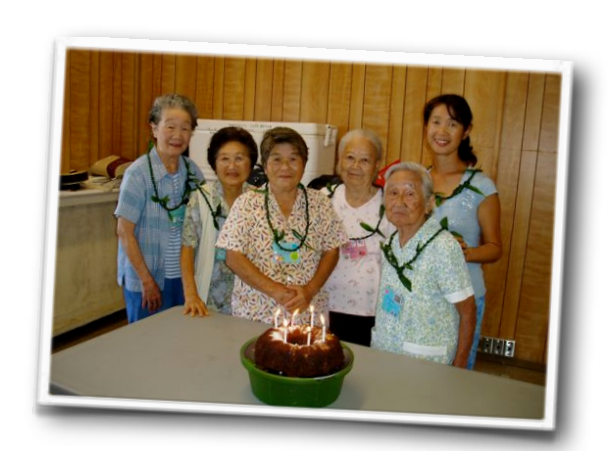
Project Dana September Birthdays