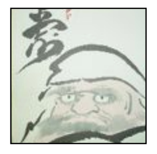
Treasuring the Past, Embracing the Present

We hope you'll join us for a morning of meditation, chanting, song, and Dharma fellowship.