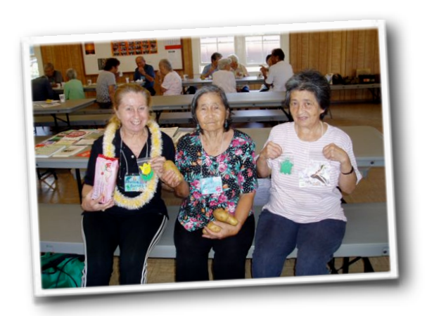
Hot Potato Winners!