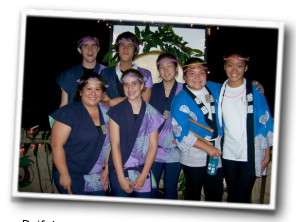
Daifukuji Taiko at Coffee Fest Lantern Parade