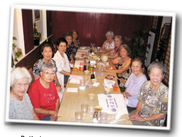
Baikako Dinner at Teshima's, Oct. 20