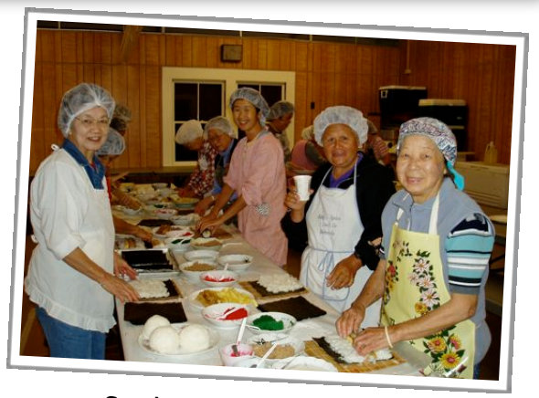
Sushi Rollers at Work