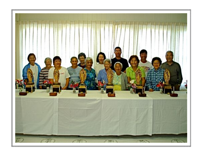
33 Kannon Set Up Helpers